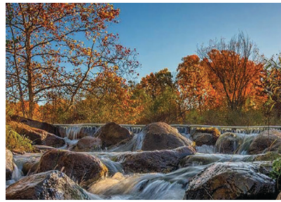
Little Calumet River

0185 S. Holmesville Rd. • La Porte, IN 46350 New Durham Township, La Porte County 219-325-8315 • Fax: 219-325-8317 • lcparks@csinet.net