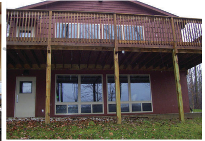
EEC - Environmental Education Center