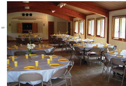
Decorated Patricia J. Smith Hall