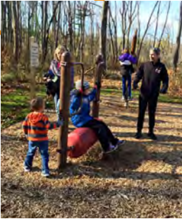
Playground on Trail 1