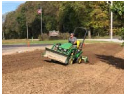
Maintenance staff and others worked on the new parking lot and restrooms at Bluhm.