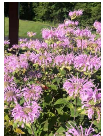
Removal of non-native plants continues at all of our parks. They are replaced with native species.