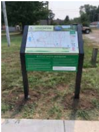
The Shared Bikeways routes were updated and now use the Ride with GPS App.