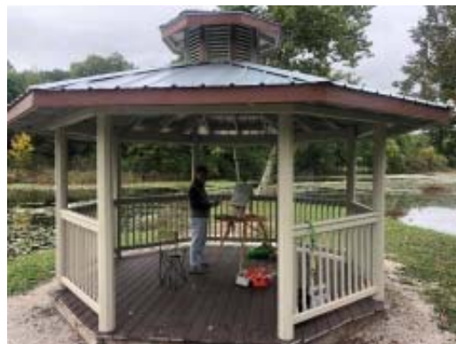
The Maintenance staff moved this gazebo to Red Mill and remodeled it.