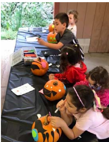
The naturalist staff did 70 public programs with over 4000 participants.