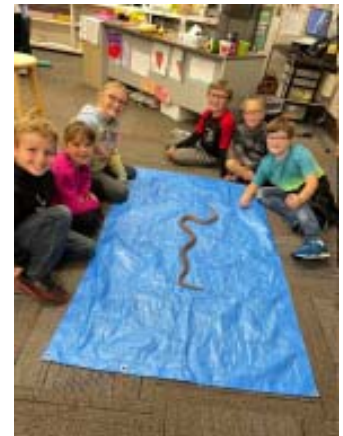
The naturalist staff did 90 School and Group programs with over 2500 participants.