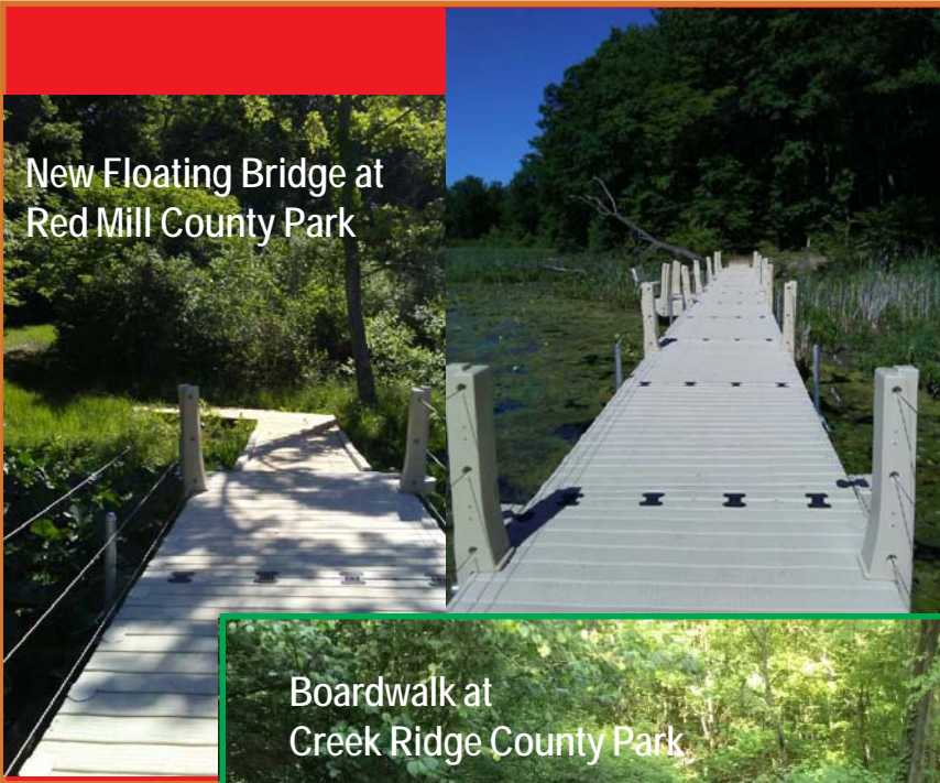
New Floating Bridge at Red Mill County Park