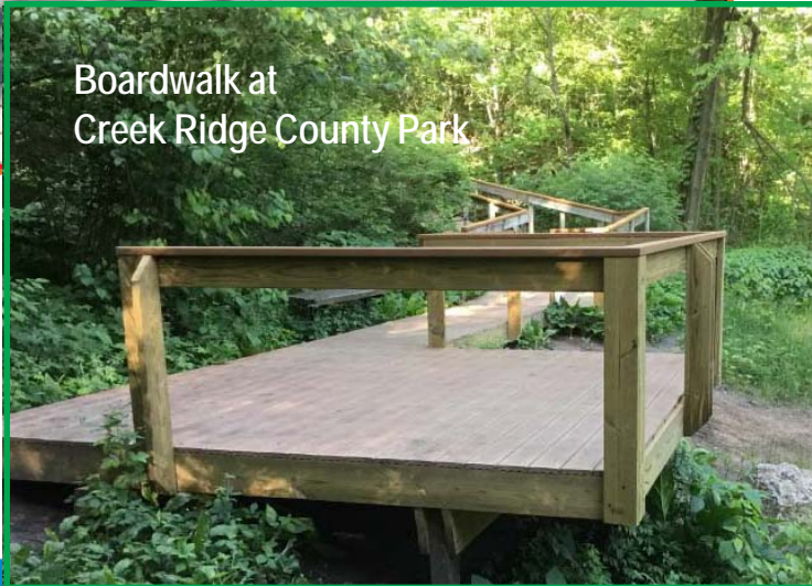
Boardwalk at Creek Ridge County Park